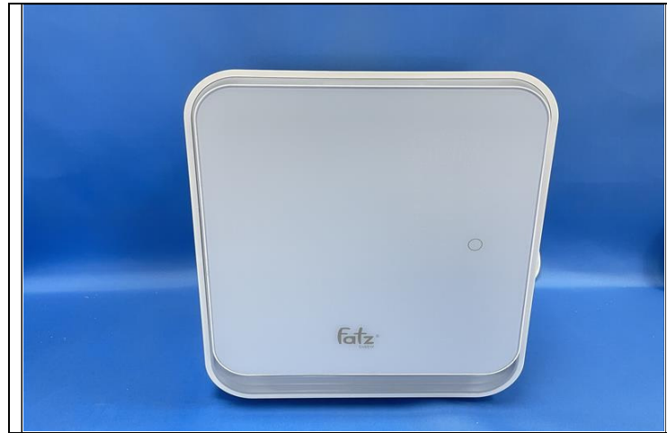
PHOTO OF SUBMITTED SAMPLE FOR TESTING

REPORT RESULTS REFER TO SUBMITTED SAMPLE (S) ONLY *** End of Report ***