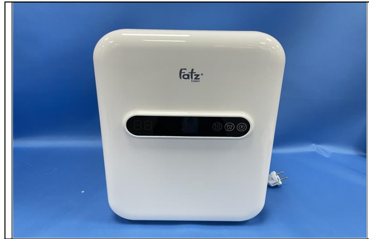
PHOTO OF SUBMITTED SAMPLE FOR TESTING

REPORT RESULTS REFER TO SUBMITTED SAMPLE (S) ONLY *** End of Report ***